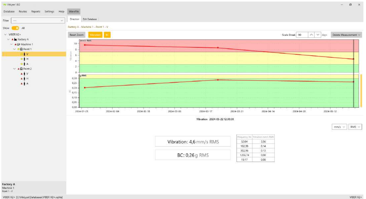
Trend graph in VibLyze displaying vibration data from VIBER X2+