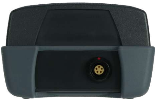
Front view, featuring the input connector for the accelerometer