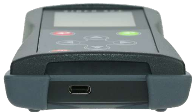
Rear view, equipped with a USB-C connector for data transfer and battery charging